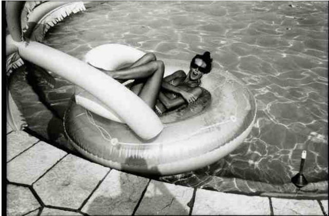
Elle Macpherson, 1991.

Called "Pool Party in the Snow", the exhibition lines up black-and-white images portraying Calvin Klein, Mick Jagger and Sharon Stone, among others.