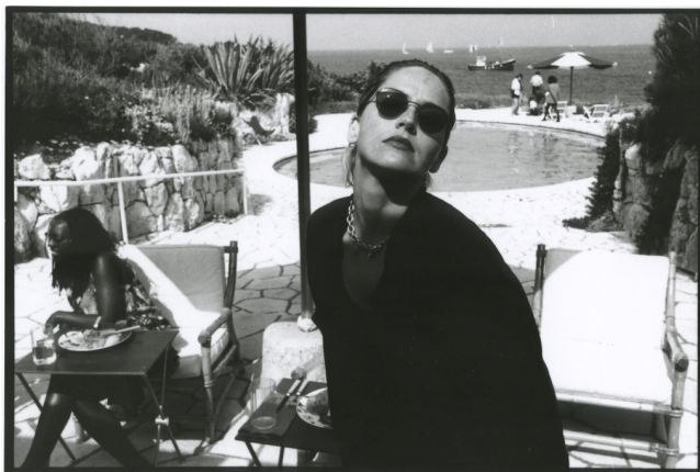
Sharon Stone, 1992.